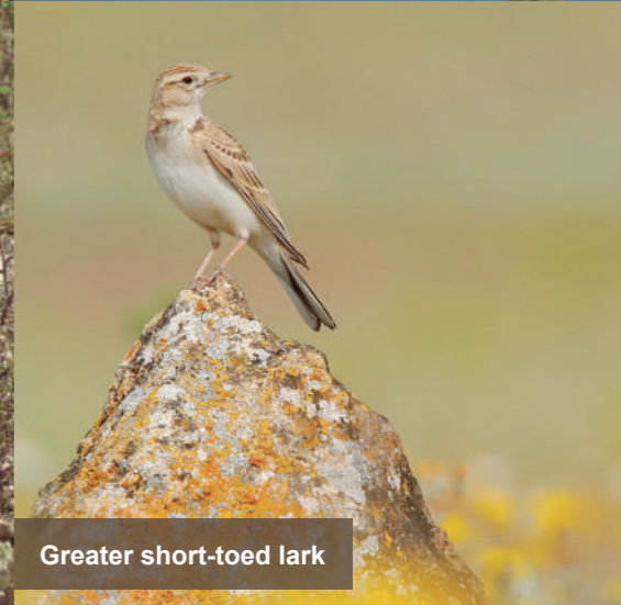
Greater short-toed lark